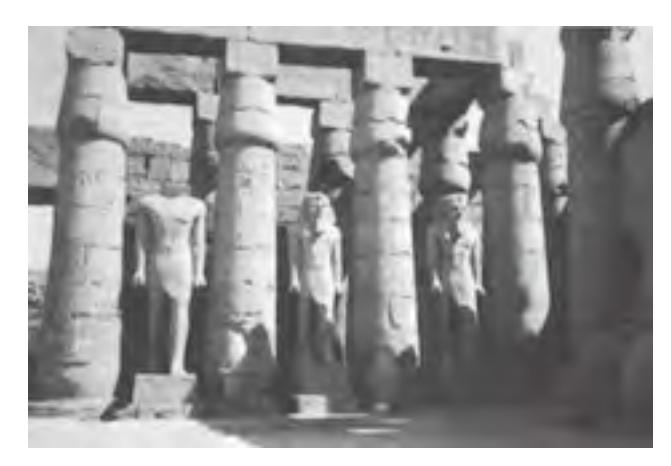
Exhibit 2:

Travel also satisfied people's curiosity. The earlier Pharaohs used the good building stone of the Nile to construct great tombs and temples as early as 2700 BCE Over a thousand years later the Egyptians found themselves surrounded by this historical treasure chest. Writers noted that visitors left messages to show they had been there (graffiti?) and took home remembrances of the trip (souvenirs?).