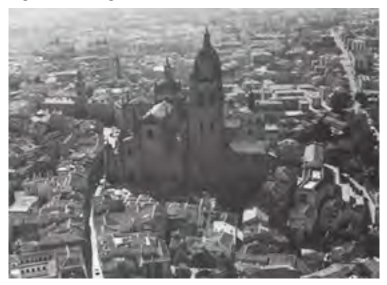
Exhibit 3: Visits to religious sites remain popular—Segovia Cathedral

Pilgrims. As the Roman Empire collapsed in the fifth century, roads fell into disuse and barbarians made it unsafe to travel. Whereas a Roman courier could travel up to 160 kilometers a day, the average daily rate of journey during the Middle Ages was 32 kilometers.