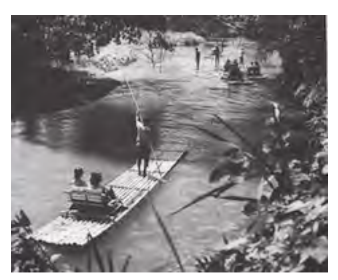
Exhibit 1: Present-day travel by water.

Travel was necessary between the central government and the outlying territories. To accommodate travelers on official business, hospitality centers were built along major routes and in the cities. Egyptians also traveled for pleasure, and public festivals were held several times a year. Herodotus, sometimes called the first travel writer, observed: