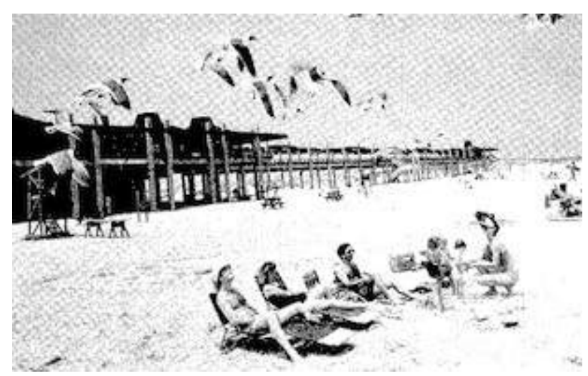
Exhibit 8:

United Nations' Rome Conference . In 1963, the United Nations Conference on International Travel and Tourism in Rome recommended a definition of the term "visitor" to include any person who visits a country other than the one in which he or she lives for any purpose other than one which involves pay from the country being visited.