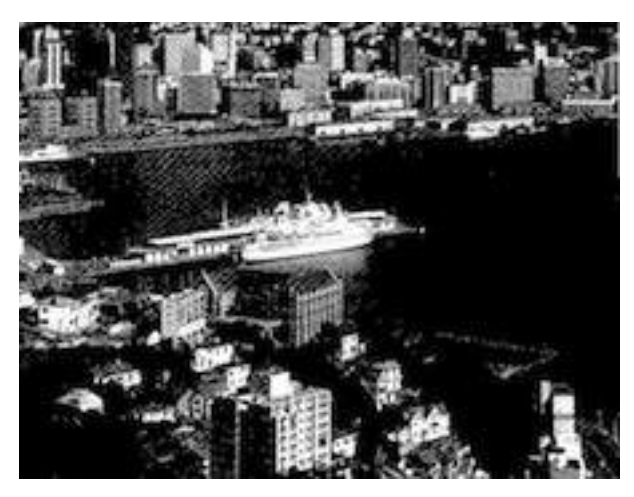
Exhibit 14: Cruises satisfy many needs.

One ad in Scottish newspapers showed two little girls in Canada. One was reading a letter. She turned to the other and said: "Guess what, Grandma and Grampa are coming . . . from Scotland!" Grandparents reading this have underlying needs for love, and the message makes them aware of that. Now they want to visit their grandchildren in Canada. They are motivated to travel. The message has not only made them aware of their need but also suggested how it can be satisfied.