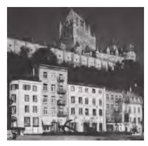
Exhibit 6: Chateau Frontenac, Quebec.

As America grew, each town sought to have its own Tremont House to symbolize how successful and prosperous it was.