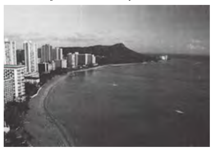
Exhibit 4: The ultimate "seaside resort", Waikiki.

The ladies dressed in flannel cases Show nothing but their handsome faces.<sup>5</sup>