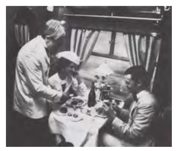
Exhibit 5: Aboard the Orient Express.

The heyday of the railroads lasted approximately 100 years, from the 1830s to the 1930s. Railroads in the United States could not meet the challenge of the airlines, which offered speed over long distances, or buses that provided luxury coaches over shorter distances. Railroads in some cases sought to dissuade people from using rail transport. They felt there was much more profit to be made from hauling freight. Use of rail tracks by long, heavy and slow freight trains means that American passenger trains can never reach the speeds of European and Japanese trains. Tracks are in such poor shape that speed is severely limited.