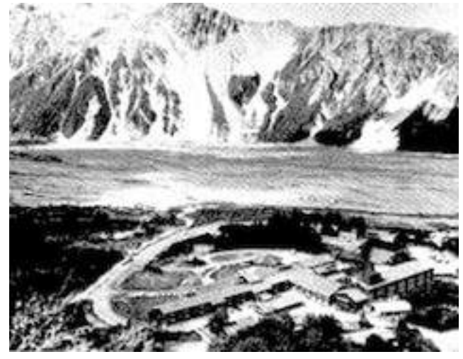
Exhibit 10: The importance of natural resources— Mt Cook.

It is said that opposites attract, and that is certainly true in tourism. North Americans are drawn to the sun of Florida in winter; places that have no snow send tourists to the slopes of Colorado in winter. Because climatic changes are seasonal, it is desirable to make use of the natural resources throughout the year if possible. For years the resorts of Colorado relied totally on winter ski business. After one particularly bad year ("bad" for a winter resort means little or no snow) resort owners realized that if the snowfall was poor their entire year was ruined.