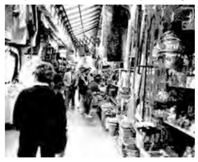
Exhibit 11: Shopping in Hong Kong.

Most support services for tourism are small businesses. This presents both advantages and potential difficulties for the destination. On the positive side, the fact that the businesses are small means that the tourist dollar is spread among those people within the destination. Many hosts share in the benefits of tourism. A major difficulty is that many small businesses fail because they lack the capital and/or the management expertise of larger operations.