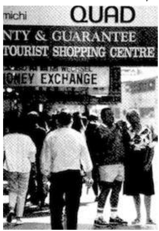
Exhibit 13: Tourists need—and spend—money.

It might be saved, it might buy a compact disk player, or it might be spent on a getaway weekend. This illustration helps us realize that the tourism dollar is in competition with other consumer products. Before we can get the tourists to our destination or facility we must first get them interested in the idea of taking a vacation.