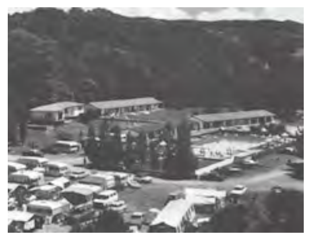
Exhibit 7: Present-day motel—Hururu.

One traveler who decided to do something about it was Kemmons Wilson. On a vacation trip with his family he found cramped, uncomfortable rooms, extra charges for children, and less than adequate restaurants. In 1952, he opened a motel that would be the first Holiday Inn. It had a swimming pool, air conditioning, a restaurant on the premises, a telephone in every room, free ice, dog kennels, free parking and baby sitters available. As occupancy increased in motels, it decreased in hotels.