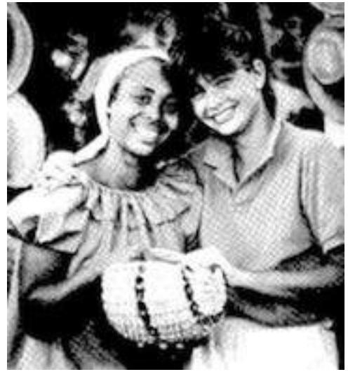
Exhibit 12: Jamaican hospitality.

Each time a tourist meets an employee or resident of a tourist area is a "moment of truth".